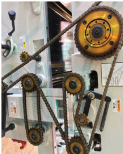
Gears on Gootdek double-sided planer. Taiwan machinery is known for quality.