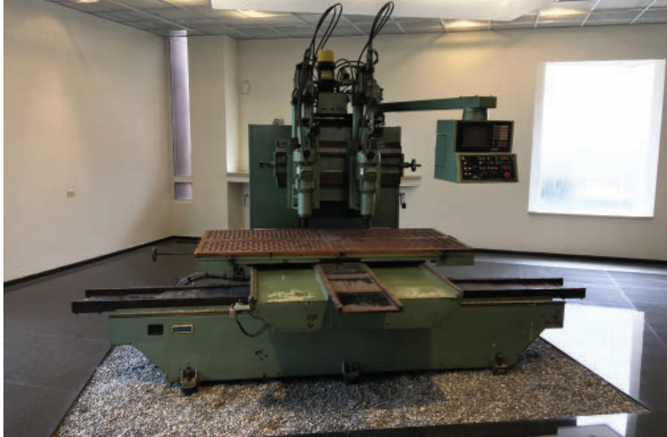
Anderson Group's first CNC, built in 1985, can still run.

More than 80 percent of Taiwan wood machinery manufacturers are located in the central part of the country, near the city of Taichung. +