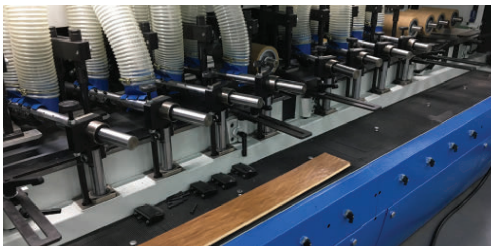
Leadermac sorting (above) and moulding machinery is widely used in hardwood flooring operations around the world.