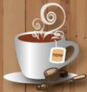
Exhibit Profile 【Tea & Coffee Area】