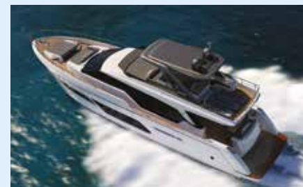
Amal's portfolio now includes Ferretti