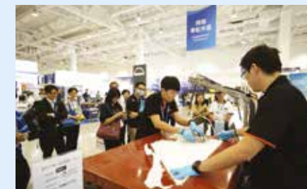
'Incredible Composites Applications'