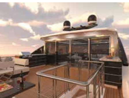
The 24m Ocean Alexander 84R