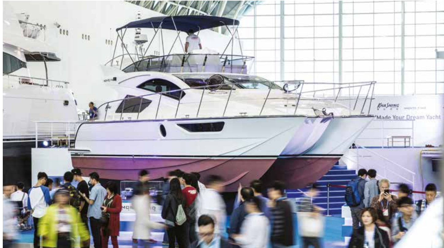
As the biggest indoor boat show in all of Asia, TIBS 2020 will have something for everyone when it returns to Kaohsiung in March

“Of course we would like to expand sales further, but more importantly we want to continue to promote the recreational yachting lifestyle in Taiwan”