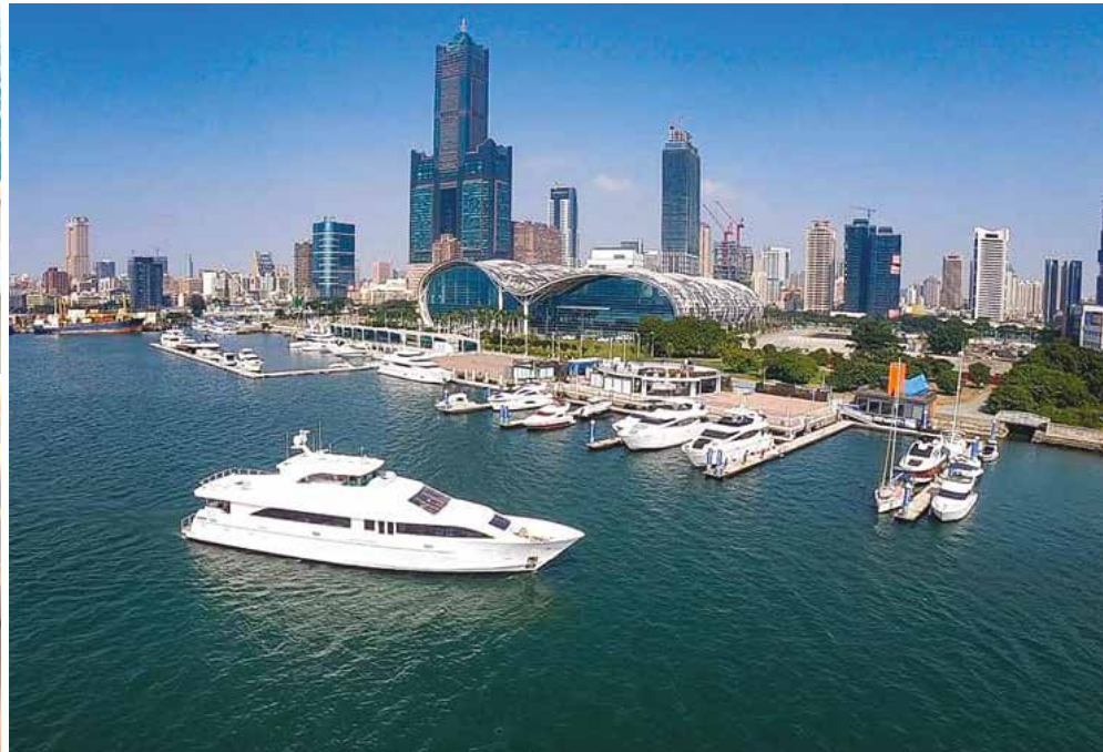
Nearly 80% of Taiwan's yacht manufacturing industry is located in or around Kaohsiung