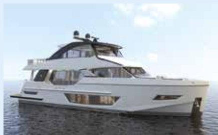
The OA 84R had its world debut at FLIBS