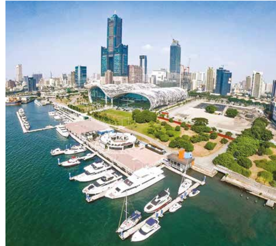
Kha Shing Pier 22 is located directly outside the Kaohsiung Exhibition Centre

“Taiwan yacht-builders are famous throughout the world, but the Taiwan people have almost zero knowledge of boating. Charter is a great way to fix that”