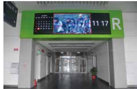
LCD5 TV Wall above the Entrance Door (4th Floor) NEW USD 1,700 Max. length: 5 minutes Broadcasted alternately