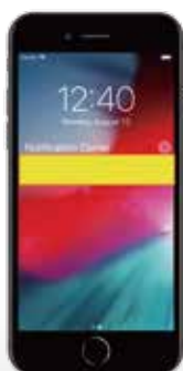
SP7 Official APP Push Notifications