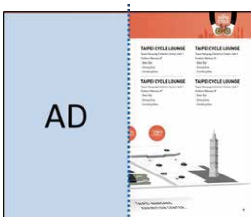
SG4 Cross Page Ads USD 4,100