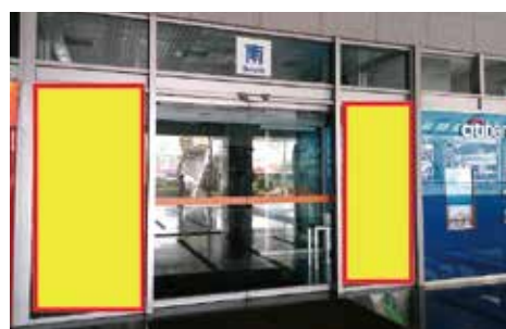
NIEC5 Entrance Banner (near to MRT Exit) NEW USD 3,400/each Offered to 2 Exhibitor