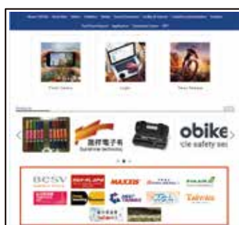
SP5 Official Website Home Page Logo Banner

Offered to 3 Exhibitors Broadcasted alternately