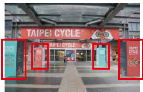
NIEC4 Two Column Brandings in front of entrance NEW USD 5,500 Offered to 2 Exhibitors 2 sides per column