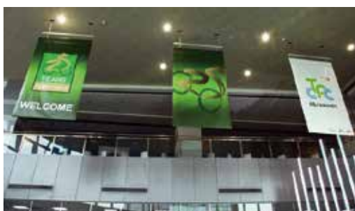
NIEC6 Hanging Banner in the Entrance Foyer (1st Fl.) NIEC7 Hanging Banner in the Entrance Foyer (4th Fl.) USD 2,700/pc Offered to 6 Exhibitors