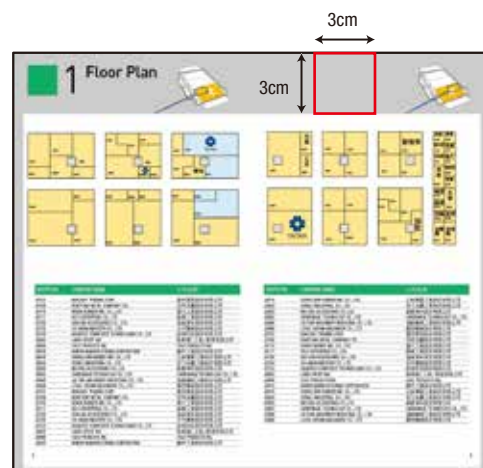
SG7 Quarter Page Ads USD 700