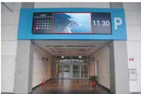
LCD4 TV Wall above the Entrance Door (1st Floor) NEW USD 1,700 Max. length: 5 minutes Broadcasted alternately