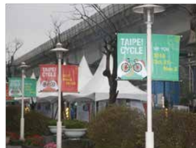
NIEC3 Pole Banners around the Exhibition Hall USD 6,700 Offered to 1 Exhibitors Interspersed with show banners