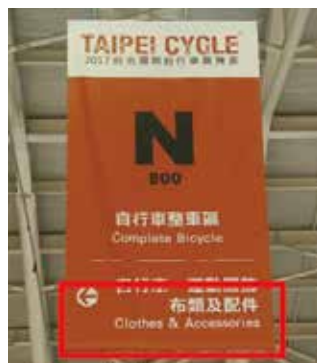
NIEC8 Hanging Banner USD 5,000 Offered to 2 Exhibitors AD range 1/5 of bottom side