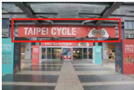
NIEC2 Main Entrance Banner NEW USD 6,700 Offered to 3 Exhibitors