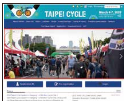
SP4 Official Website Home Page Ads (1 month)