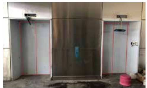
NIEC19 Elevator Branding (B1.1st Fl.,4th Fl.) USD 1,700/pc Offered to 6 Exhibitors AD range 2/3 of bottom side