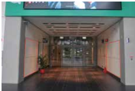
NIEC17 Entrance Banner in the Passageway (1st Fl.) NIEC18 Entrance Banner in the Passageway (4th Fl.) USD 2,700 /pc Offered to 4 Exhibitors