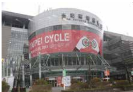
NIEC1 Mega Banner USD 12,000 Offered to 1 Exhibitor