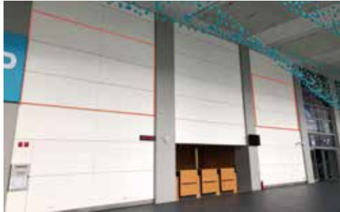
NIEC15 Mega Banner in the Entrance Foyer (1st Fl.) NEW (next to Service Counter) USD 6,700/pc Offered to 2 Exhibitors