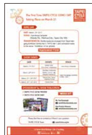
SP6 Taipei Cycle eDM Banner