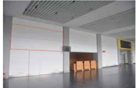
NIEC16 Mega Banner in the Entrance Foyer (4th Fl.) NEW (next to Service Counter) USD 5,400/pc Offered to 1 Exhibitors