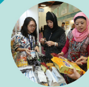
2018/2019 HALAL TAIWAN Exhibition Scale

Most Taiwan companies have earned their good name due to customization expertise. With OEM & ODM experiences, Taiwan companies have made them superb partners like no other. 2020 HALAL TAIWAN will invite more halal-certified producers to satisfy diverse halal tastes and appetites, OEM, ODM, or small-volume custom orders.