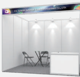
Shell Scheme (1 booth)