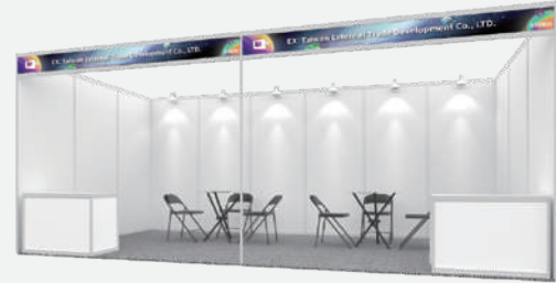
Shell Scheme (2 booths)