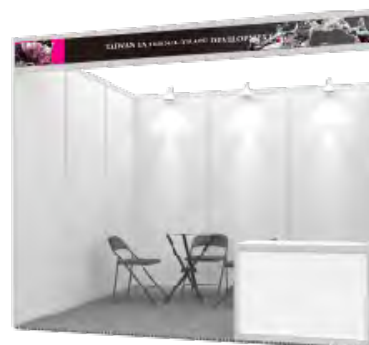
3M*3M Shell Scheme